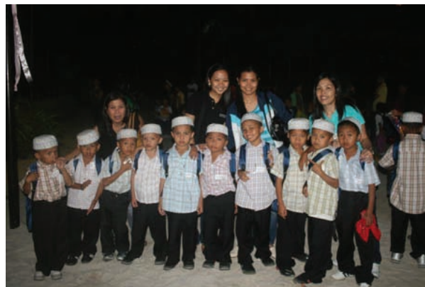
Alas, Oplas staff posed with Dar Amanah's Kids.