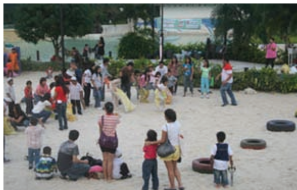
Kids and foster parents played sack race.