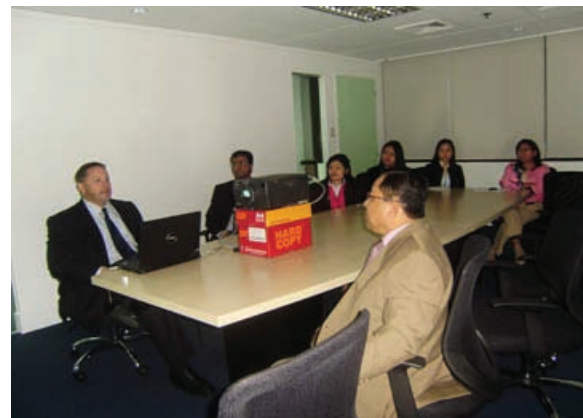
The inspection team, together with the Firm's top management discussed the result of inspection.